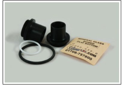
Vaporiser service kit