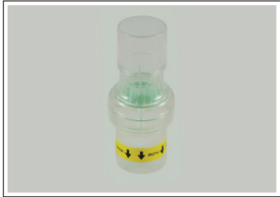
One way valve 22M x 22F