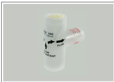
Overpressure valve 7.5