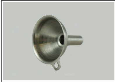
Mini funnel for vaporiser