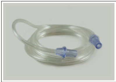
Oxygen supply tube