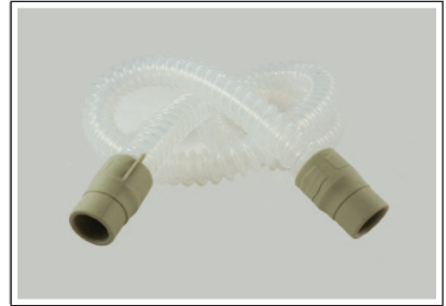
Single silicone tube adult 1.2m