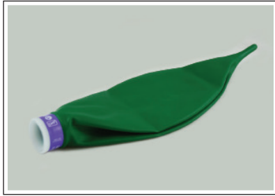
1 litre reservoir bag