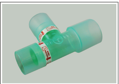
One way valve 22F-22M-22M